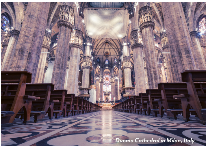
Duomo Cathedral in Milan, Italy

Ideally located in the heart of Como, the belle époque Palace Hotel graces the lungolago , the lakefront promenade. The city's marble Duomo and the pedestrian-friendly town center are just steps away from your front door. Begin each day with a sumptuous breakfast buffet featuring a variety of hot and cold dishes, rounded out with freshly baked breads and pastries. After a day of exploring, gather with your traveling companions at the Garden Bar for aperitivo , Italy's evening tradition of cocktails and delicious snacks. The menu at Ristorante Antica Darsena, the hotel restaurant, features Italian and international cuisine prepared with the freshest seasonal produce. When the day draws to a close, sleep well in your tastefully decorated and well-appointed guest room.