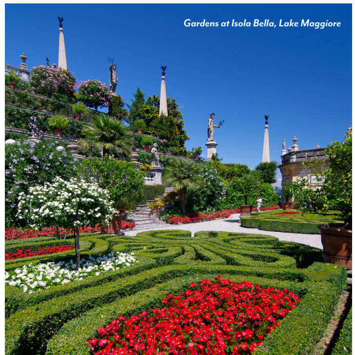
Gardens at Isola Bella, Lake Maggiore

All Program Features are contingent upon final brochure pricing. 2025