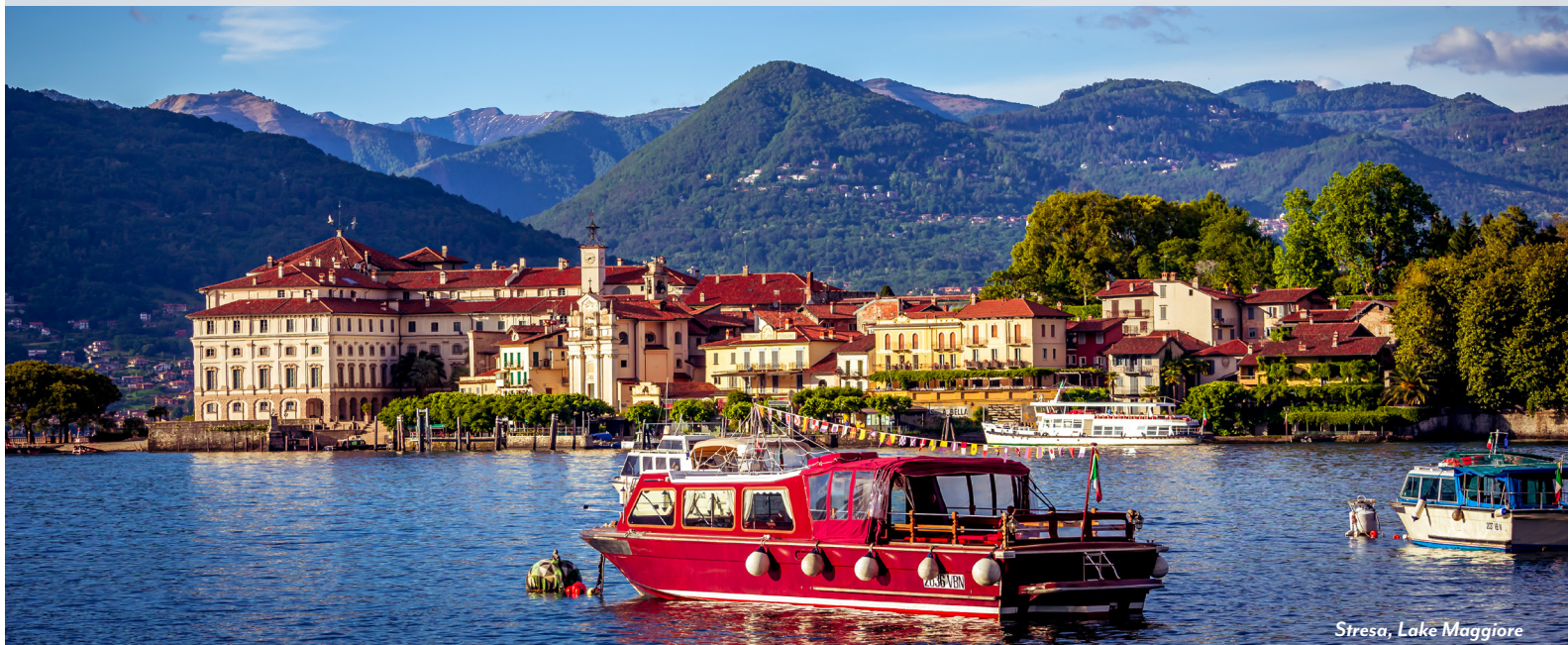
Stresa, Lake Maggiore