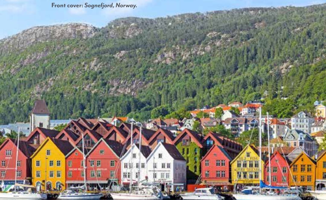
Bryggen harbor, Bergen, Norway