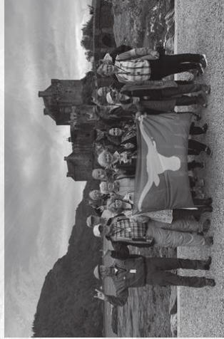
Texas Exes on Orbridge's Stunning Scotland 2022 travel program.

Membership in The Texas Exes is a requirement for all participants in the Flying Longhorns travel program. Alumni, friends of the University, UT faculty and staff, and parents of current UT students are welcome to join. Our dues are 80% tax-deductible and memberships start at just $50.