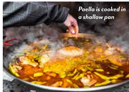
Paella is cooked in a shallow pan

Morocco and the coasts of Portugal and Spain have a rich culinary history that has changed the face of global cuisine, most remarkably with dishes featuring bold flavors and spices. One of the most famous foods hailing primarily from Valencia, Spain, is paella — a flavorful rice dish traditionally made with olive oil, chicken broth, vegetables and a variety of meats and seafood. The dish got its name from the traditional wide, shallow pan used to cook it, with paella literally meaning “frying pan” in Valencian Spanish. The signature yellow color of the dish traditionally comes from saffron, but turmeric and calendula can be used as substitutes. Paella had humble beginnings, originally being considered a lunchtime meal for farmers and made with whatever was on hand at that time. Another popular dish native to the region is couscous , which has roots in Morocco and is prepared from ground wheat rolled into pellets. Experience these savory cultural staples firsthand on our tour with a cooking demonstration and lunch in Tangier, Morocco, and an optional trip to the market in Valencia, followed by a paella cooking class with a local chef.