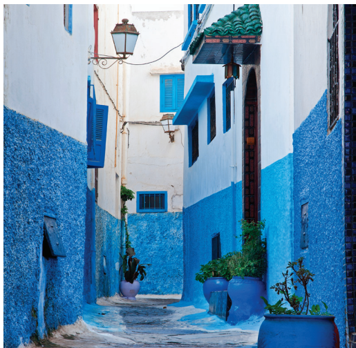
Rabat’s Kasbah des Oudaias

Day 12: Marrakech This morning we travel by horse-drawn carriage from Menara Park to Majorelle Gardens, a private botanical garden known for its cobalt blue accents. Following a tour of the gardens we visit the nearby Yves St. Laurent Museum. The afternoon is at leisure before dinner tonight at a local restaurant in the city’s Old Town. B,D