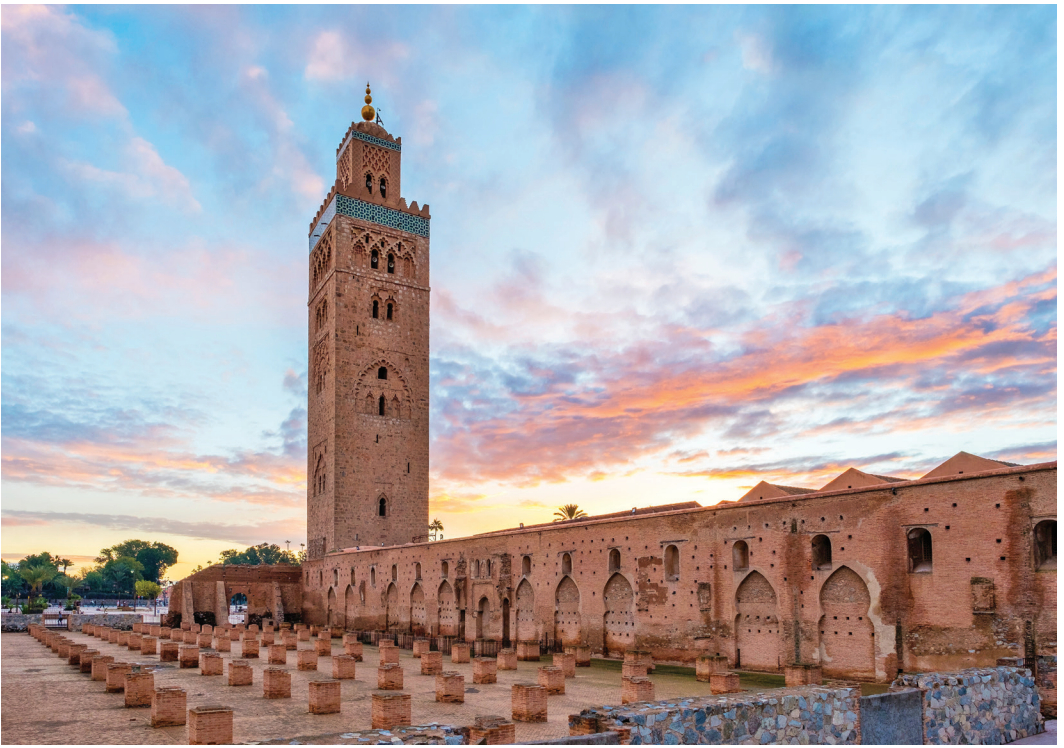
We see the distinctive Koutoubia Mosque – Marrakech’s largest – on Day 11.

Day 6: Fez Today we tour the old Mellab (Jewish quarter) and its 17 th -century synagogue and the royal gates. Then we walk through the Fez medina , where we see some hidden treasures, including the Blue Gate, the most picturesque of the Old City’s historic gates; the medieval school of Bouanania; the 12 th -century home of Jewish scholar Maimonides; and the authentic food market. The remainder of the afternoon is free for independent exploration and lunch on our own. B,D