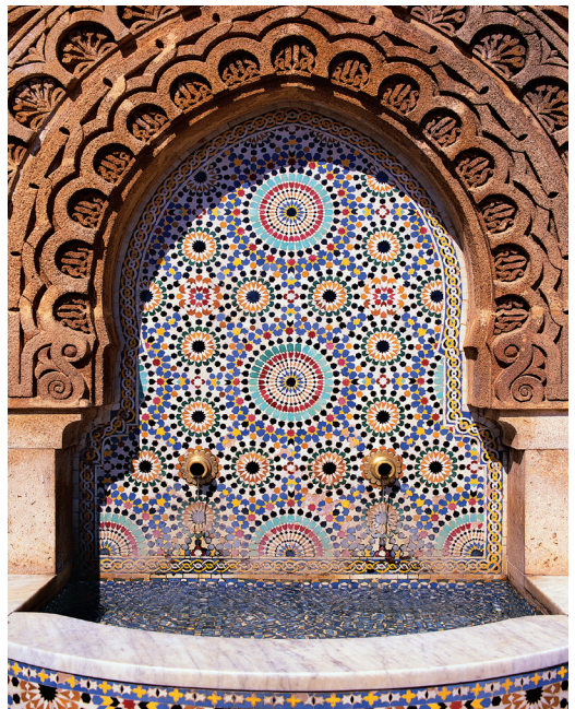
Traditional Moroccan tile work

Day 10: Ouarzazate/Ait ben-Haddou/Marrakech En route to Marrakech today, we stop first at uninhabited Ait ben-Haddou, a UNESCO World Heritage site and one of southern Morocco’s most scenic villages that is often used as a location for fashion and film shoots. Its old section consists of deep red kasbah packed together so tightly they appear to be a single