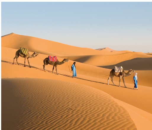
We ride camels in the Sahara.

Day 13: Marrakech/Casablanca We leave Marrakech this morning by coach for storied Casablanca, Morocco’s largest and most cosmopolitan city. After a brief orientation tour of the city, we visit the magnificent Hassan II Mosque, Morocco’s only functioning mosque open to non-Muslims. Sitting on the Atlantic shoreline, the mosque boasts a prayer hall the size of London’s St. Paul’s Cathedral. Tonight we celebrate our Moroccan adventure at a farewell dinner at a local restaurant. B,D