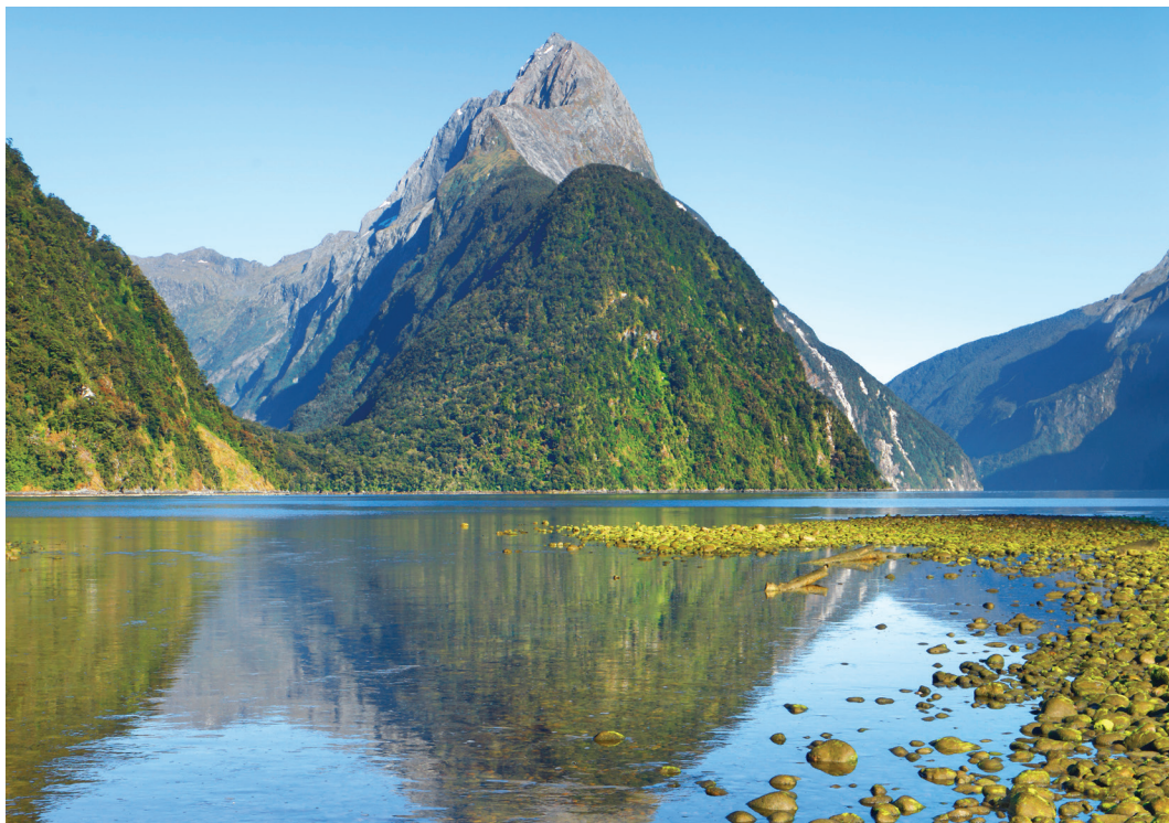
We visit Milford Sound on Day 16.

Day 9: Cairns/Great Barrier Reef This morning we board a boat for a day-long excursion to the Great Barrier Reef, at 1,200 miles long the world's largest living organism and richest marine resource. We pull up at Michaelmas Cay where we can swim, snorkel, or view the reef from a semi-submersible vessel. B,L