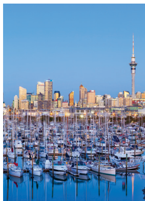
Auckland, City of Sails

Day 19: Rotorua This morning we visit Paradise Valley Springs, which showcases New Zealand’s biodiversity with native flora and wildlife, including alpaca, llama, and wallabies. Then we drive to National Kiwi Trust, dedicated to rehabilitating injured kiwis, the national bird. This evening we visit Tè Puia Thermal Reserve and Cultural Centre for a traditional hangi dinner and Maori performance. B,D