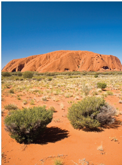
Aboriginal site of Uluru (Ayers Rock)