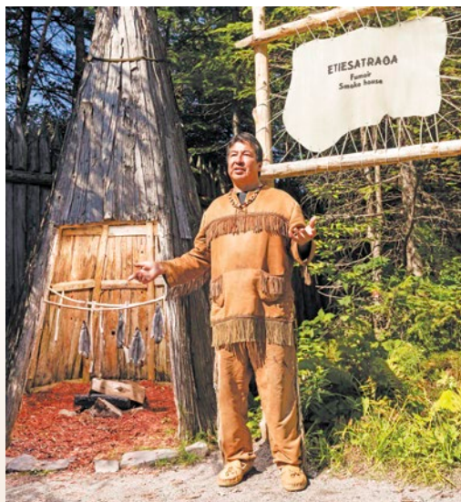
Traditional Huron Site, Wendake Huron reserve