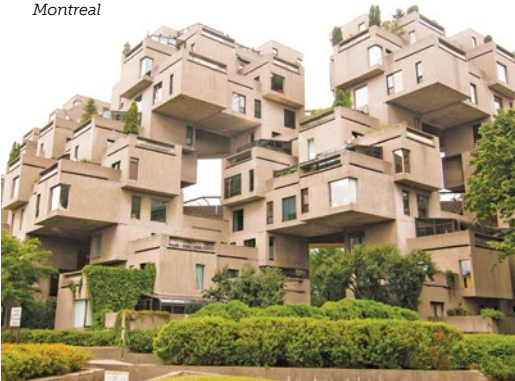
Habitat 67, Montreal

Huron-Wendat Nation at a recreated Wendat village. Visit the longhouse and smokehouse and delve into sweat lodge purification rituals. Continue to Québec City and check in to the Clarendon Hotel.