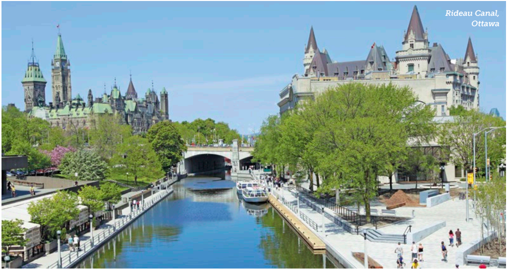
Rideau Canal, Ottawa