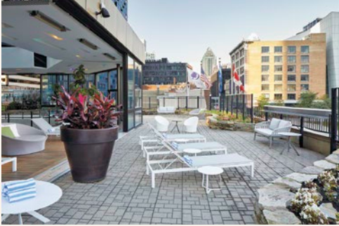
DoubleTree by Hilton Montreal | Montreal