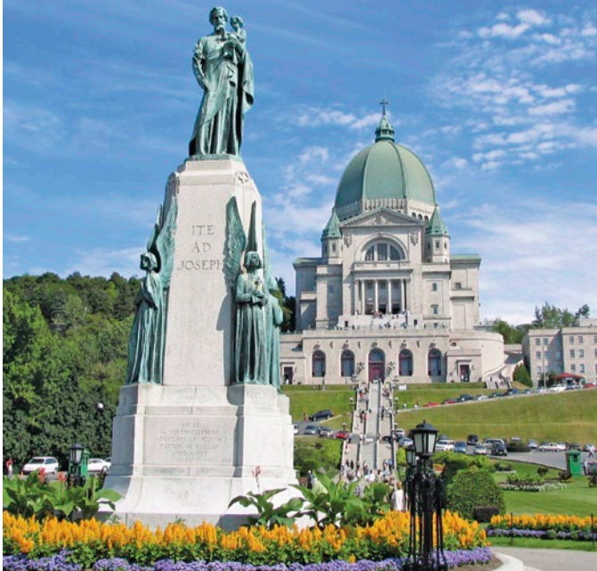
St. Joseph's Oratory, Montreal