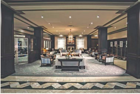
Lord Elgin Hotel | Ottawa