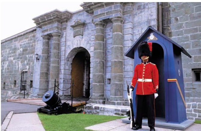
Above: Entrance, Citadelle de Québec | Below: Old Montreal and Old Port, Montreal