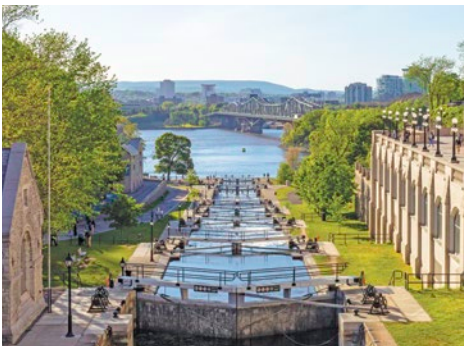
Locks of Rideau Canal