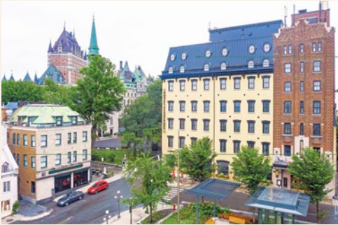
Clarendon Hotel | Québec City