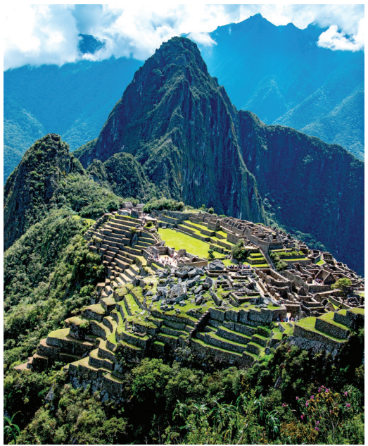
We explore the amazing ruins at Machu Picchu on Days 5 & 6.

Day 15: Quito/Depart for U.S. This morning we set out to explore Quito with its well-preserved historic center as we see on our city tour. Highlights include Plaza la Independencia and the 16 th -century Monastery of San Francisco. We then enjoy a tour of Quito’s Botanical Gardens featuring an orchidarium with more than 1,200 species of orchids; and a visit to Ñaquito Market, a colorful riot of fresh produce and spices. Then we return to our hotel for some leisure