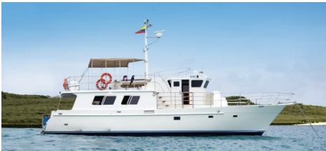
We stay in comfort for four nights in spacious rooms at the Royal Palm Galapagos, set in the lush highlands of Santa Cruz island, and enjoy day cruises aboard the Santa Fe, our privately chartered yacht.