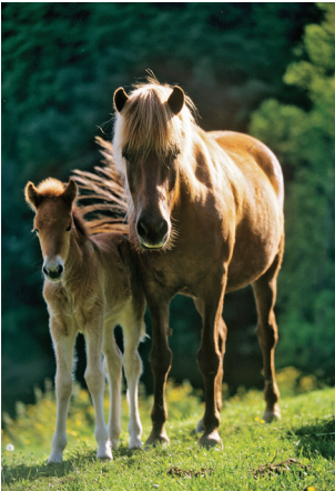
We may see wild horses while on our tour.

is where Iceland’s Althing, or national assembly, met in open-air sessions from 930 CE to 1798 – Thingvellir also sits on an active volcanic site at the spot where the fissure between the geological plates of North America and Europe is most evident in Iceland. It’s also a gem of nature, with canyons, caves, waterfalls, and ponds surrounded by snowcapped mountains. We learn about the historic parliament founded here in 930 CE, and walk along a gorge into the rift valley itself. Following our visit here, we head to a local farm for lunch, then depart for famed Great Geysir and Gullfoss, Iceland’s immensely popular “golden” waterfall. We continue on to Reykjavik, home to more than half of the nation’s population and ranking as one of the world’s safest and cleanest cities.