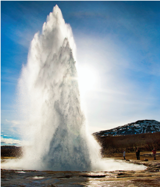
Iceland’s hot spring geysers are natural attractions.

This morning we embark on a tour of the Icelandic capital. Sites include Hallgrímskirkja, the country’s largest church, with a sculpture garden and excellent views of the city; the