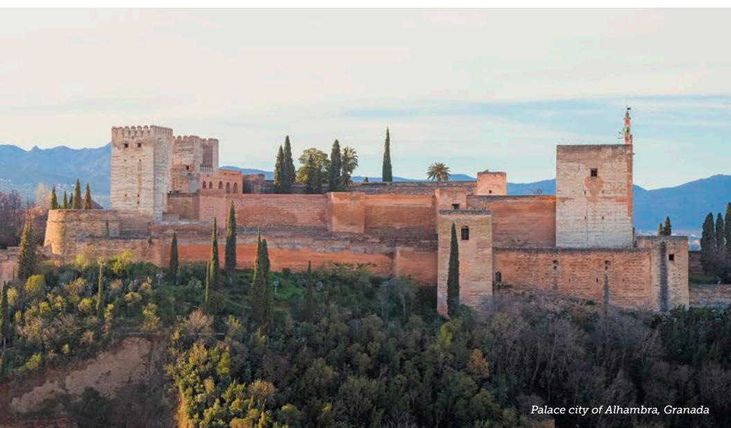
Palace city of Alhambra, Granada

Finish with a walk through the scenic Barrio de Santa Cruz and savor lunch on your own. Gather for dinner tonight at the parador.