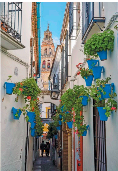
Jewish Quarter, Córdoba