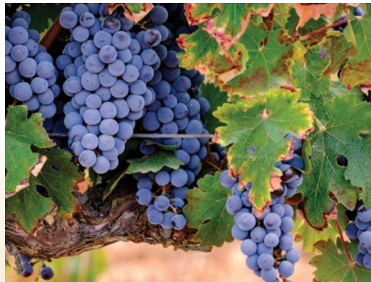
Vineyard near Ronda

Flamenco Performance. This evening, relish dinner at a local restaurant in Antequera while delighting in a special flamenco performance.