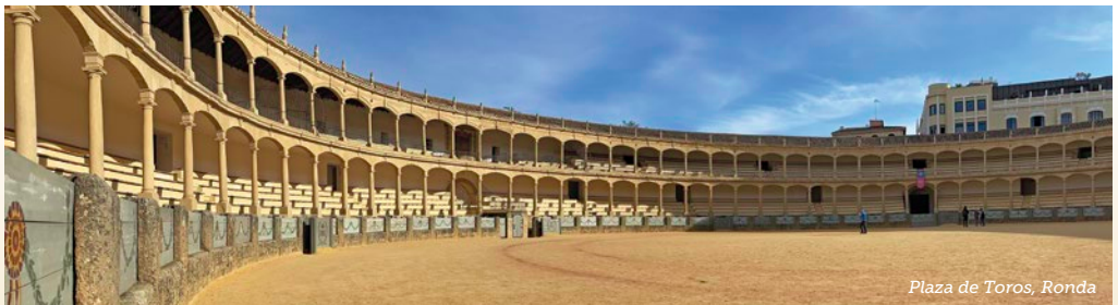
Plaza de Toros, Ronda

Sevilla City Tour. Journey to the cultural heart of southern Spain on a panoramic/walking tour. See the centuries-old bullring and the Moorish watchtower near the river. Enjoy a stop at the remarkable Plaza de España to see its canal and tiled alcoves representing the provinces of Spain. Next, tour the grand Real Alcázar, a medieval Moorish palace still in use today as a royal residence, and the stunning Cathedral of Sevilla, the world's largest Gothic church. These structures stand in the heart of Sevilla as proud representation of the Spanish Golden Age.