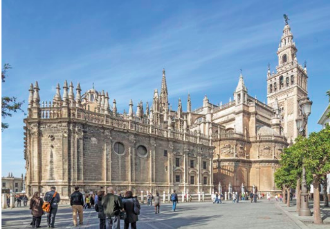
Cathedral of Seville