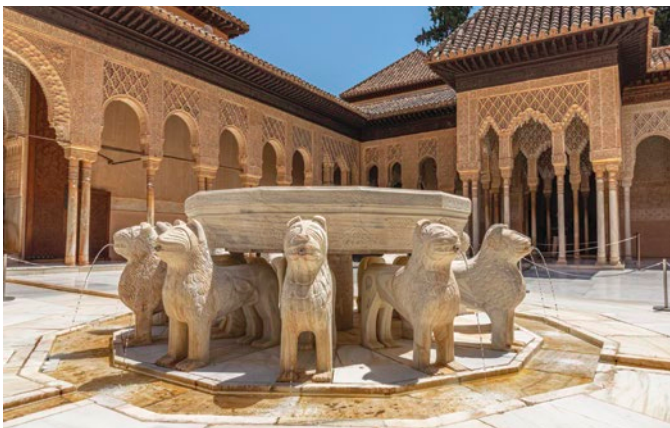
Patio of the Lions, Alhambra, Granada