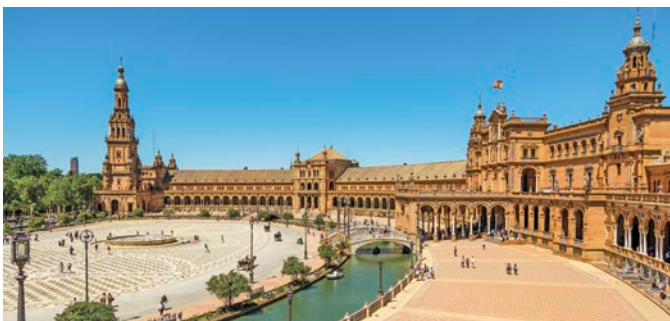
Plaza de España, Sevilla