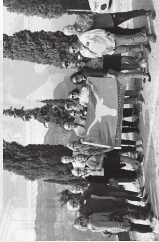
Texas Exes on Orbridge's Flavors of Northern Italy 2023 travel program.

PRSRT STD U.S. POSTAGE PAID PERMIT NO. 825 SAN DIEGO, CA