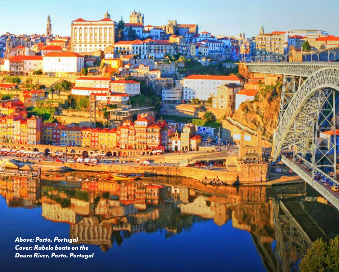
Above: Porto, Portugal Cover: Rabelo boats on the Douro River, Porto, Portugal