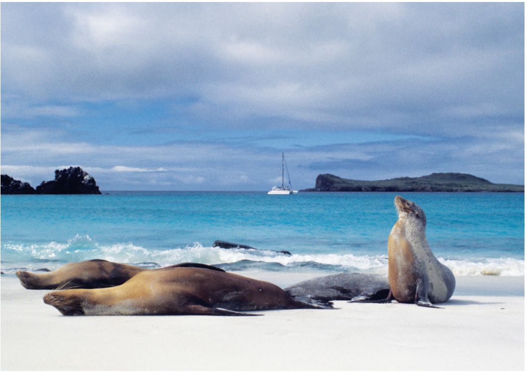
We encounter plenty of wildlife, like these sunbathing sea lions, in the Galapagos.

Day 8: Cuzco/Lima Today we return to Lima, arriving mid-afternoon. After some time to rest and refresh, we reconvene for dinner together this evening. B,D