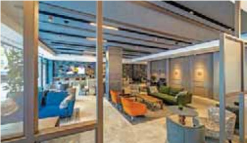
Catalonia Gran Vía Bilbao | Bilbao