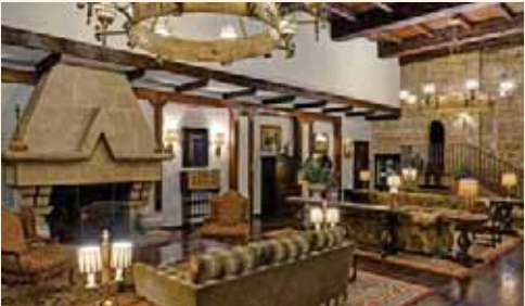
Parador de Olite | Olite