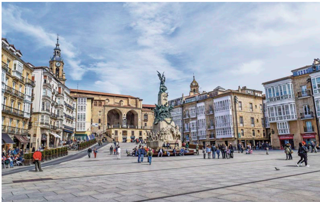
Plaza de la Virgen Blanca, Vitoria-Gasteiz