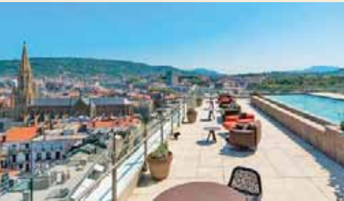
Catalonia Donosti Hotel | San Sebastián