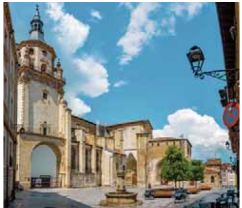
Above: Vitoria-Gasteiz | Right: Cathedral of Santa Maria, Vitoria-Gasteiz