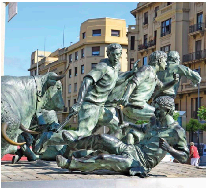
Running of the Bulls Monument, Pamplona