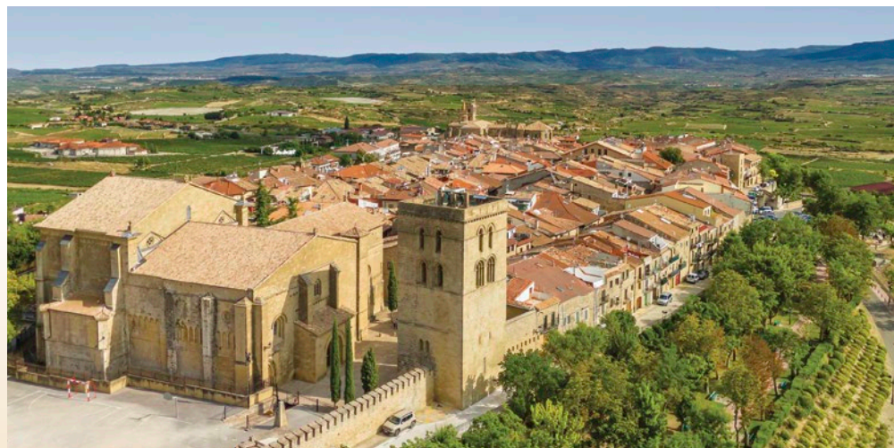
Walled medieval city of Laguardia

San Sebastián. Called Donostia in Basque, San Sebastián rose to prominence as a resort town in the mid-1800s when Queen Isabella II, heeding her doctor's advice, chose it as her summer seaside retreat. Spanish royalty and aristocrats followed, adding a touch of glamour. Today, it dazzles with gorgeous