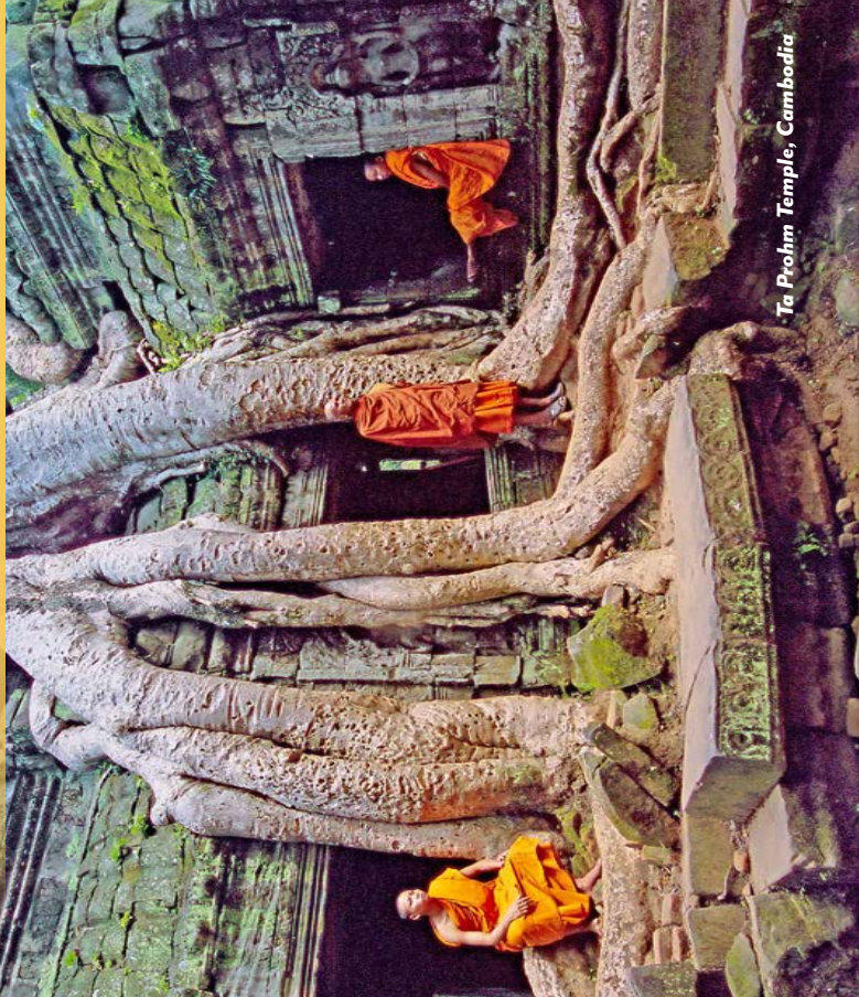
Ta Prohm Temple, Cambodia

EXTENDED SAVINGS* AVAILABLE! SAVE $2,000 PER COUPLE! Plus SINGLE SUPPLEMENT WAIVED*.