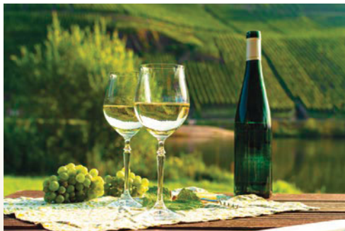
Moselle white wine