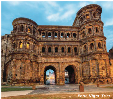
Porta Nigra, Trier