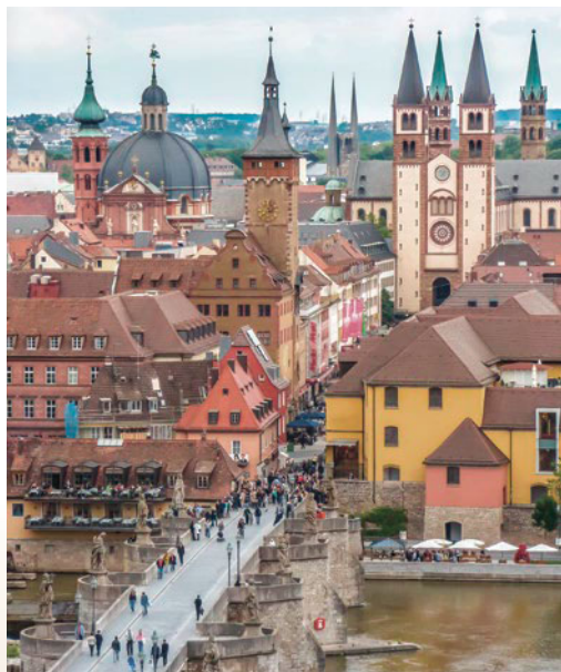
Old Town, Würzburg