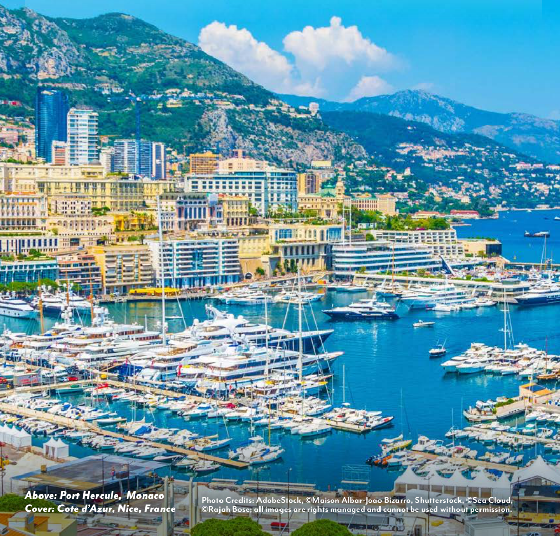
Above: Port Hercule, Monaco Cover: Cote d'Azur, Nice, France

Photo Credits: AdobeStock, ©Maison Albar-Joao Bizarro, Shutterstock, ©Sea Cloud, ©Rajah Bose; all images are rights managed and cannot be used without permission.