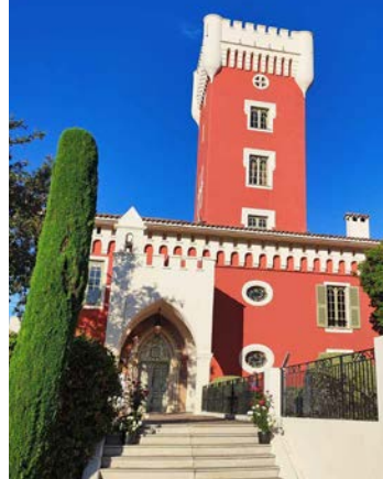
Chateau de Cremat, Nice, France

This stone watchtower was built to protect residents from menacing Barbary pirates, who threatened the coast. Sail on to the fishing village of Camogli, renowned for its pastel-colored palazzi and houses stacked up along the coastline. In the mid-1800s, the town — known as the City of a Thousand White Sailing Ships — was esteemed for its powerful merchant navy, including a fleet of tall ships. This afternoon, spend free time exploring Portofino. This picturesque village was originally named Portus Delphini (Dolphin Harbor), which evolved into Portofino. Nowadays, the beautiful harbor is filled with