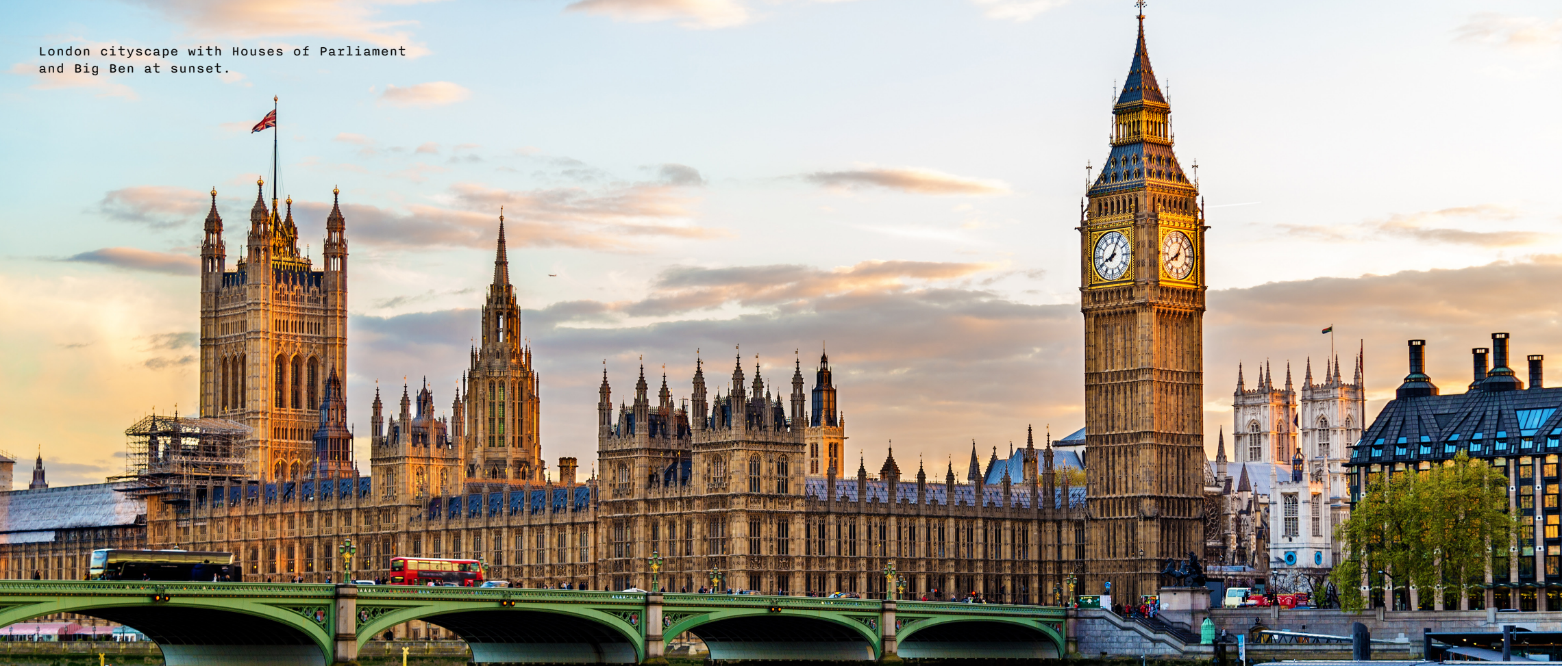
London cityscape with Houses of Parliament and Big Ben at sunset.