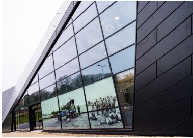
Battle of Britain Bunker