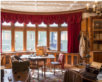
Bletchley Park Mansion