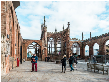
Cathedral Church of Saint Michael in Coventry