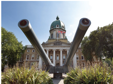
Imperial War Museum