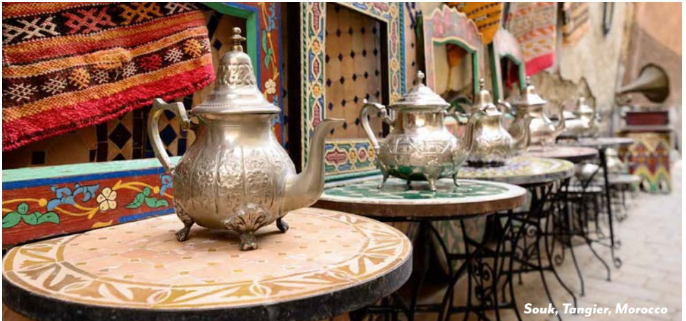
Souk, Tangier, Morocco