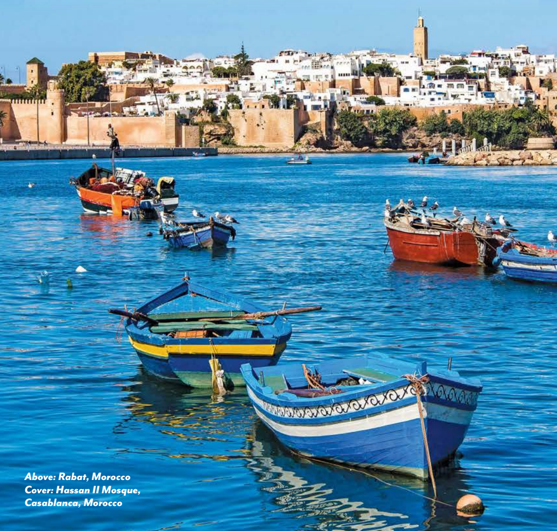
Above: Rabat, Morocco Cover: Hassan II Mosque, Casablanca, Morocco