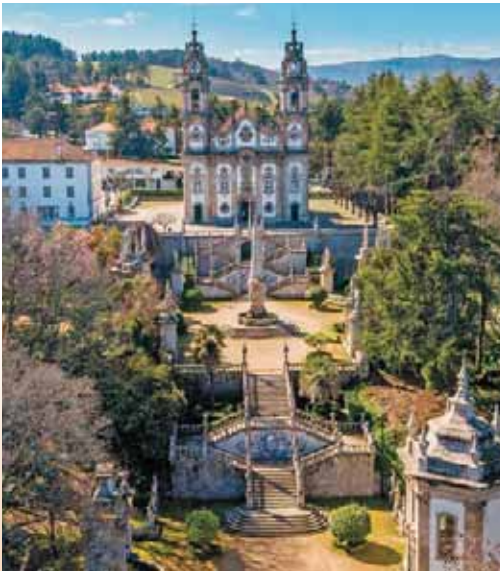
Nossa Senhora dos Remédios, Lamego