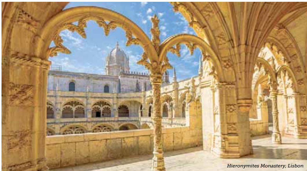
Hieronymites Monastery, Lisbon