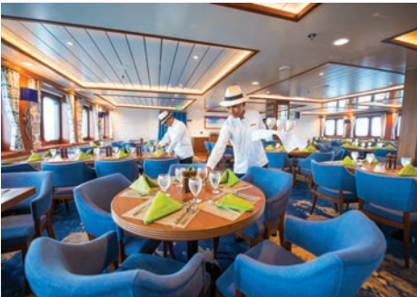
The casual dining room.

Forward lounge and bar for presentations and gatherings, restaurant, large library with Mac computer kiosks, open-air observation deck, underwater gear area and efficient Zodiac boarding platform, and open Bridge, where guests are welcome to learn about navigation from the captain and officers.