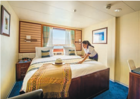
Category 4 cabin.

Served in single, unassigned seating in a sociable, informal atmosphere. Menu emphasizes Ecuadorian flair.