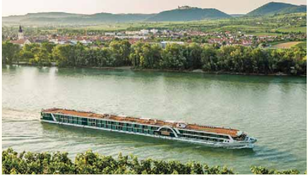
MS Amadeus Queen