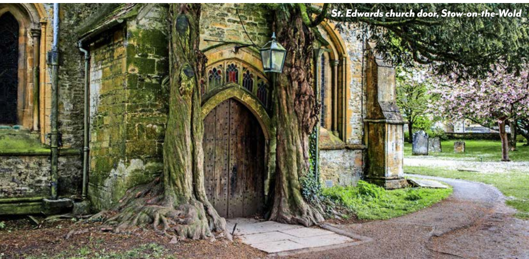
St. Edwards church door, Stow-on-the-Wold

Start the day with a guided walking tour of lovely Cheltenham. After lunch, depart for Hidcote, a world-famous Arts and Crafts-inspired garden covering over 10 acres