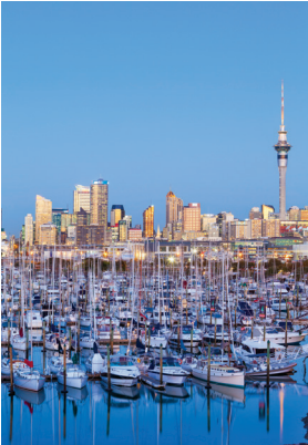
Auckland, City of Sails

Day 19: Rotorua This morning we visit Paradise Valley Springs, which showcases New Zealand’s biodiversity with native flora and wildlife, including alpaca, llama, and wallabies. Then we drive to National Kiwi Trust, dedicated to rehabilitating injured kiwis, the national bird. This evening we visit Te Puia Thermal Reserve and Cultural Centre for a traditional hangi dinner and Maori performance. B,D