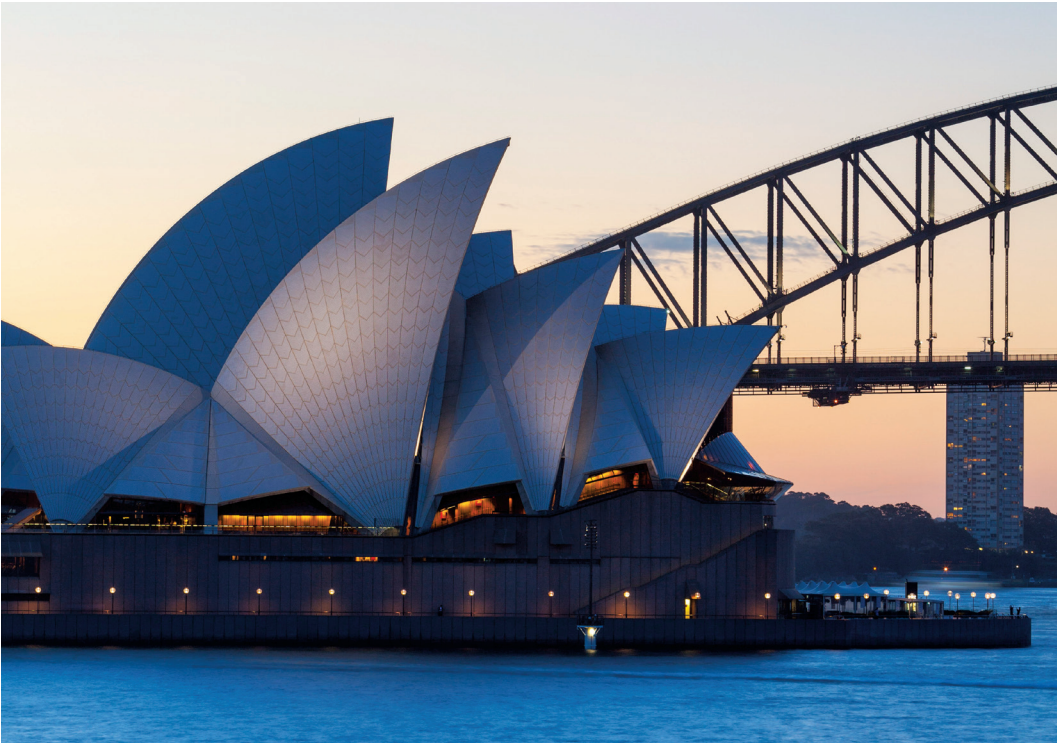
Sydney’s signature Opera House and Harbour Bridge

Day 9: Cairns/Great Barrier Reef This morning we board a boat for a day-long excursion to the Great Barrier Reef, at 1,200 miles long the world’s largest living organism and richest marine resource. We pull up at Michaelmas Cay where we can swim, snorkel, or view the reef from a semi-submersible vessel. B,L