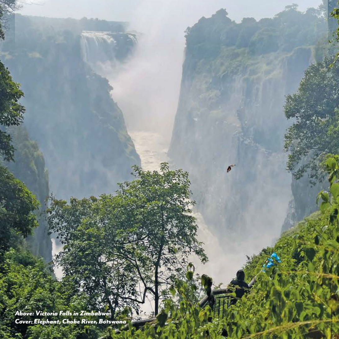
Above: Victoria Falls in Zimbabwe Cover: Elephant, Chobe River, Botswana