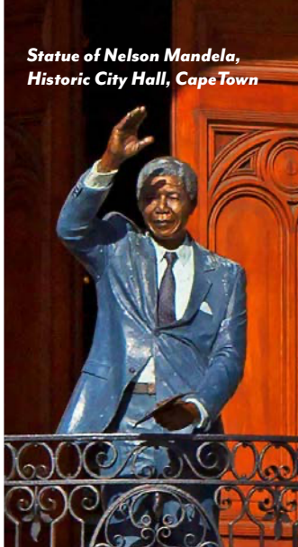
Statue of Nelson Mandela, Historic City Hall, Cape Town