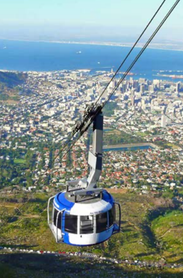
Table Mountain cable car