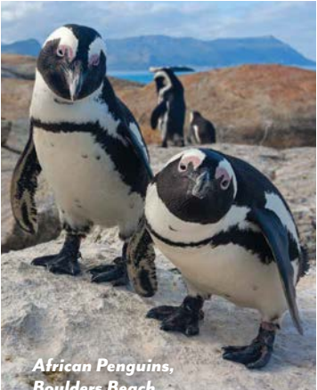
African Penguins, Boulders Beach