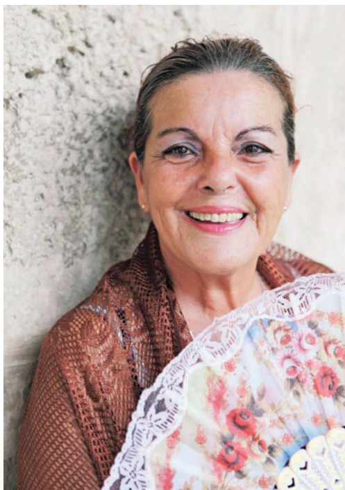
Top: Cathedral, Havana