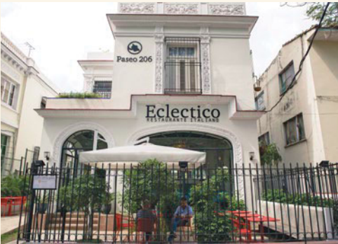
Paseo 206 | Havana