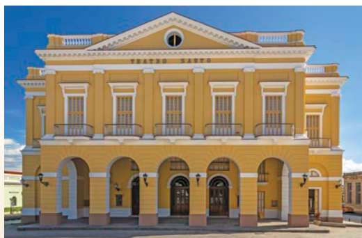
Sauto Theater, Matanzas