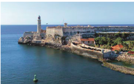
La Cabaña fortress, Havana harbor

The association is a huge proponent of continuing education and there is no better classroom than our world. Experience rich history and culture in the company of your fellow Longhorns! Are you ready for the adventure of a lifetime? We're standing by to answer all of your questions and/or take your reservation. Capacity is limited on this popular program and it may sell out quickly. Please contact the Flying Longhorns travel office at 800-594-3900 or travel@texasexes.org with questions or to make a reservation.