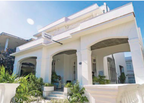
La Distancia Boutique Hotel | Havana