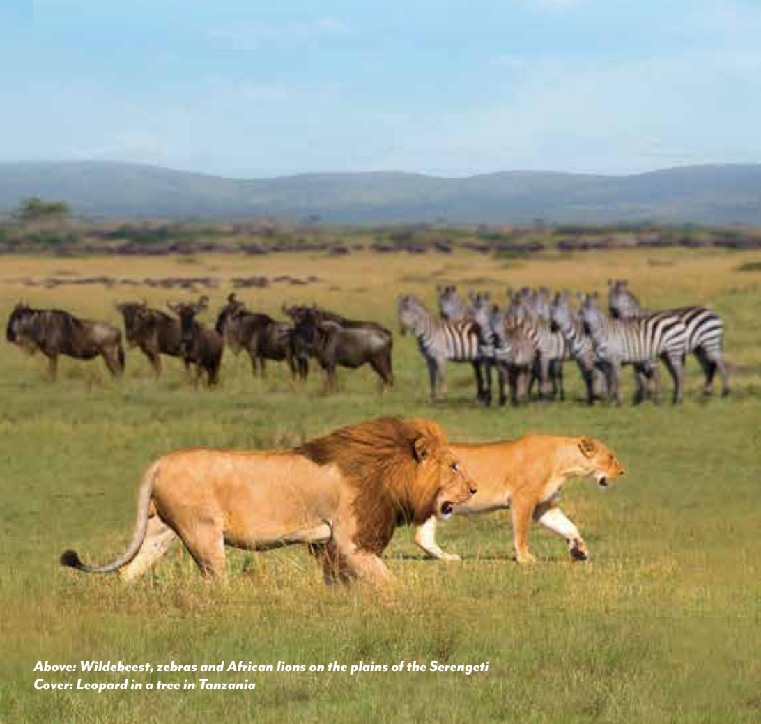
Above: Wildebeest, zebras and African lions on the plains of the Serengeti Cover: Leopard in a tree in Tanzania