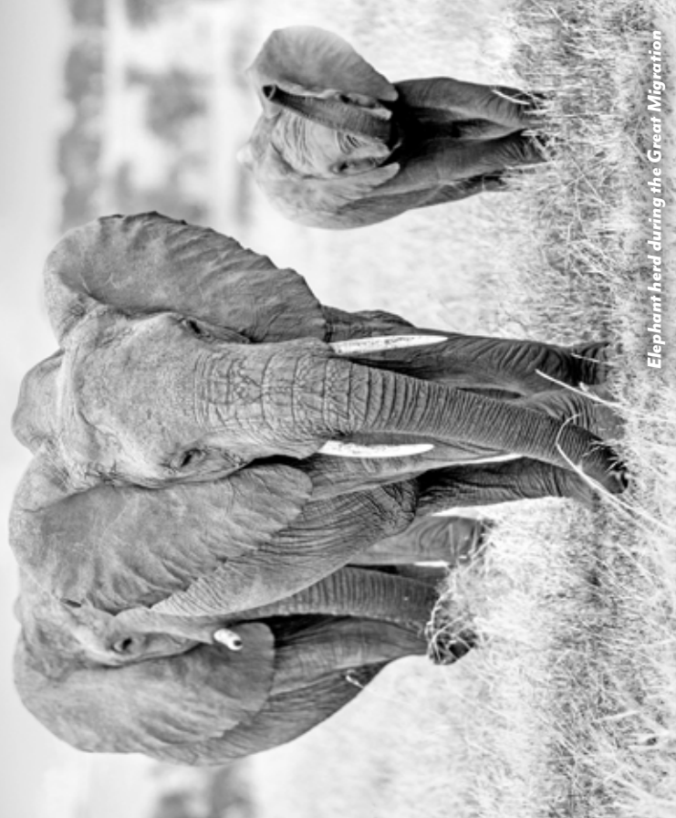
Elephant herd during the Great Migration

SPECIAL SAVINGS* AVAILABLE SAVE $2,000 PER COUPLE!