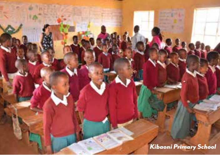
Kibaoni Primary School