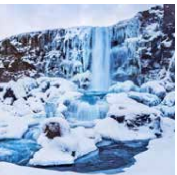
Þingvellir National Park, Iceland

Reykjavík | Siglufjördur Enjoy a scenic drive to Siglufjördur, the northernmost town on Iceland's mainland, located 28 miles from the Arctic Circle. This picturesque area, tucked between rugged mountains at the tip of the