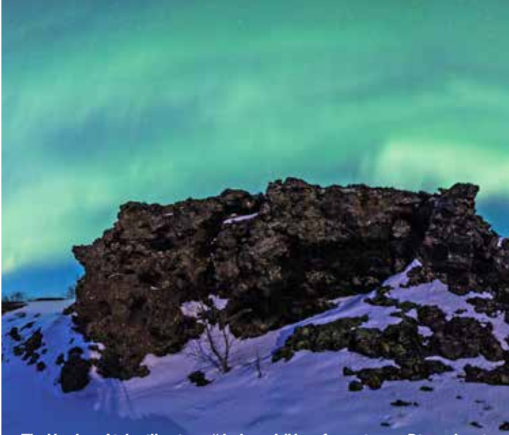
The Northern Lights illuminate "dark castle" lava formations at Dimmuborgir