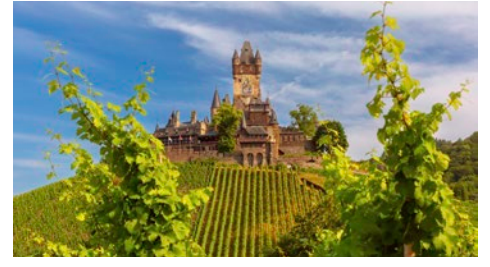
Top: Miltenberg | Above: Reichsburg Castle, Cochem