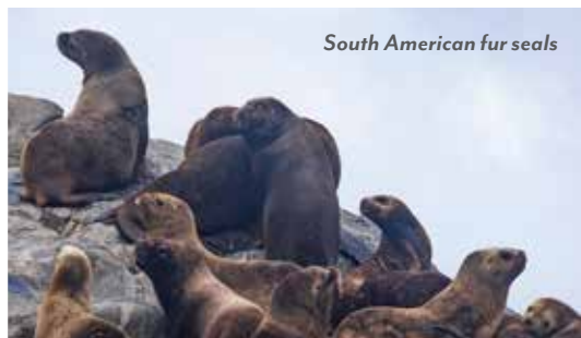
South American fur seals