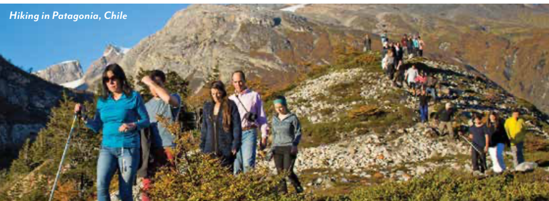
Hiking in Patagonia, Chile