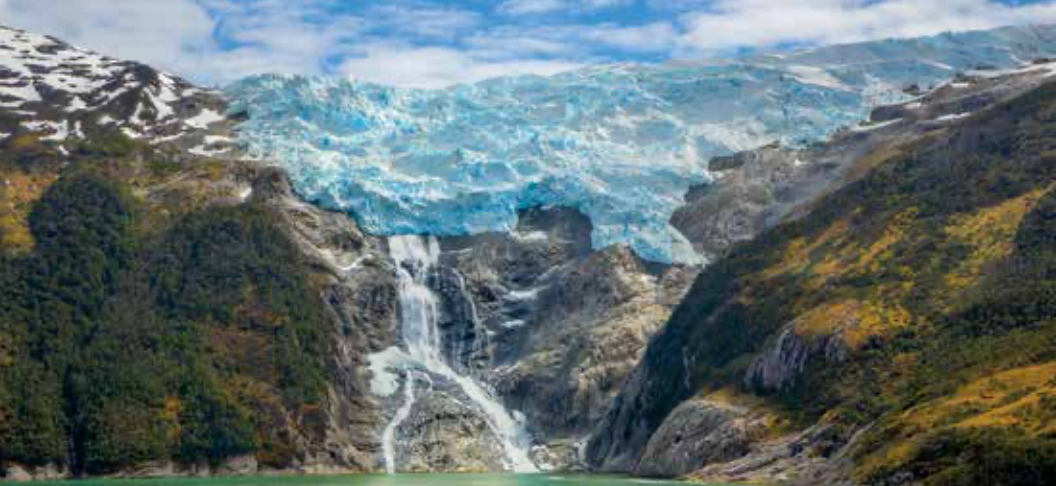
Glacial fjord of the Beagle Channel, Chile

indulge in a traditional lunch and watch a sheep-shearing demonstration at a Patagonian ranch. Continue to Punta Arenas, the gateway to Patagonia and embark the Stella Australis . Gather for a Captain's Welcome Reception and Dinner. (B,L,R,D)