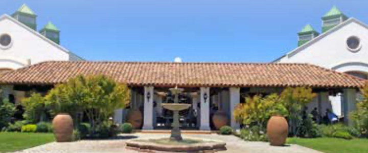
Casas del Bosque Winery, Chile

With Chile's variety of pleasing wines, from classic terroir-driven wines to obscure Marselan grapes and delectable dessert wines, wine debutants and oenophiles alike can sip, savor and return home with excellent memories.