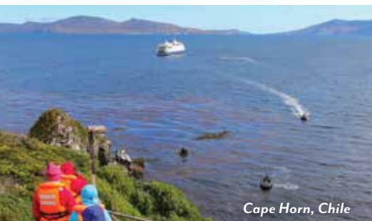
Cape Horn, Chile

While sailing toward Indonesia's fabled Spice Islands in 1520, Portuguese explorer Ferdinand Magellan became the first European to enter the channel that would later bear his name. Along the south side of the strait, amid the world's southernmost forests, smoke rose from numerous native Selk'nam campfires, leading Magellan to name this island Tierra del Humo, "land of smoke," which Spain's King Charles V changed to the more poetic Tierra del Fuego, "land of fire." The northern side of the strait came to be known as Patagonia, "land of giants," for Magellan and his men's impression of the tall, indigenous inhabitants. Three centuries later, the HMS Beagle, under the command of Admiral Robert FitzRoy and with young naturalist Charles Darwin on board, became the first ship to sail east to west through its namesake channel. Experience the same wonder of these intrepid explorers as you cruise through these mesmerizing landscapes almost untouched since Magellan explored them nearly 500 years ago.