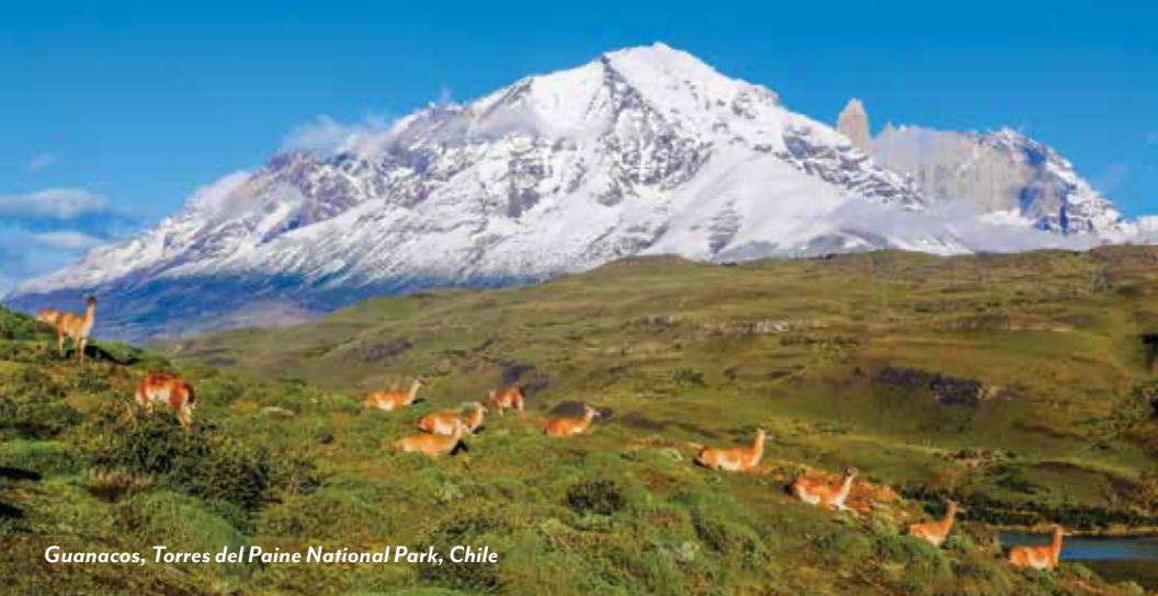
Guanacos, Torres del Paine National Park, Chile