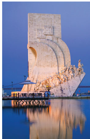
Lisbon's Monument to the Discoveries

Day 13: Madrid Our morning tour of this monumental and dignified capital city includes vast Plaza Mayor; the Moorish medieval district; and opulent