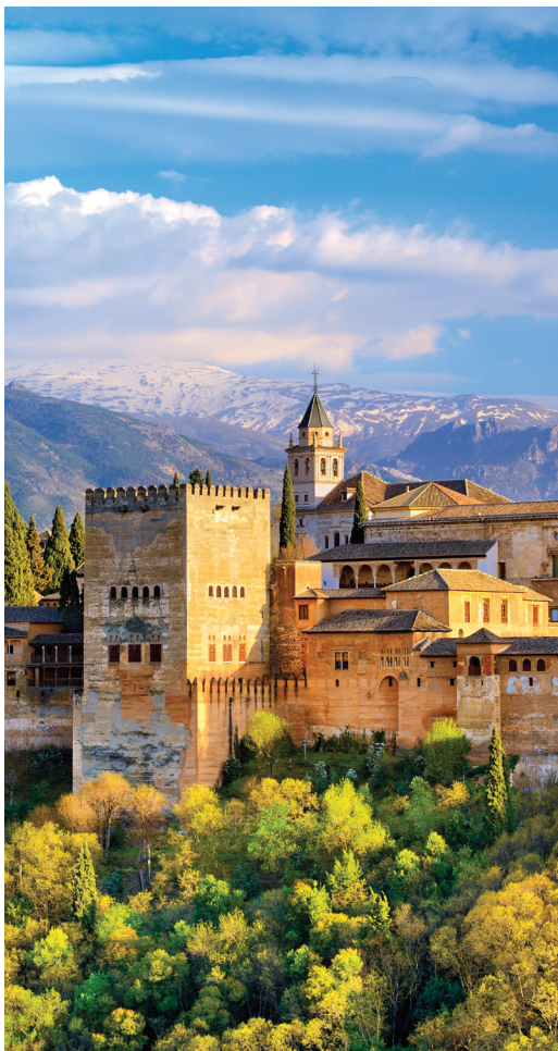
We tour the Alhambra on Day 11.