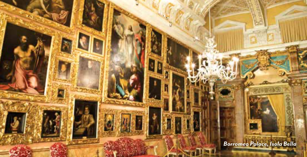
Borromeo Palace, Isola Bella