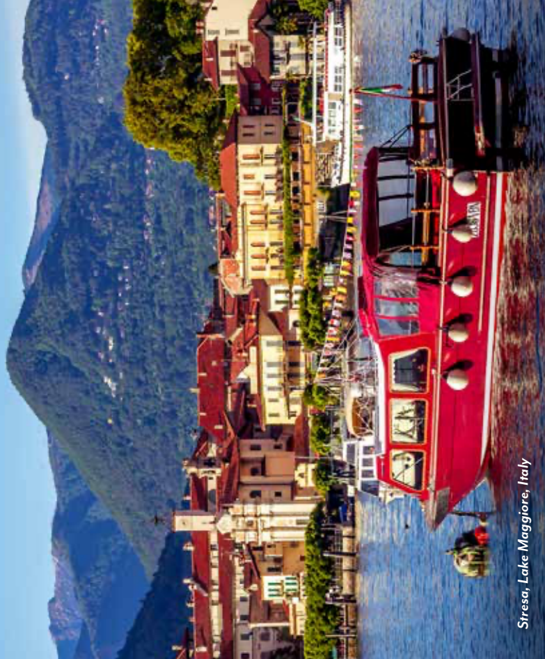
Sfresa, Lake Maggiore, Italy

PRSRRT STD U.S. Postage PAID Gohagan & Company