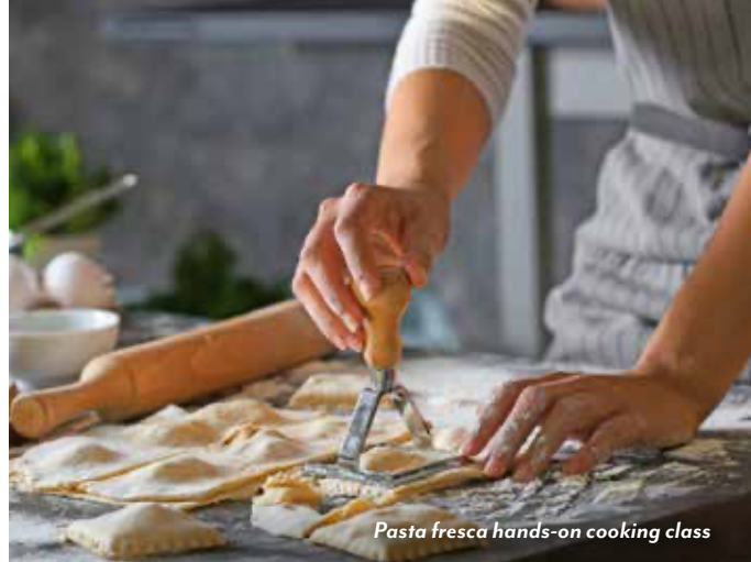
Pasta fresca hands-on cooking class

statuary, architectural details and strutting white peacocks. Reboard the boat for the return to Stresa, the setting for Hemingway's iconic novel "A Farewell to Arms." Enjoy spectacular mountain views as you explore the town and have lunch on your own. This afternoon at the hotel, hear an art lecture by a local expert, then enjoy dinner on your own. (B)