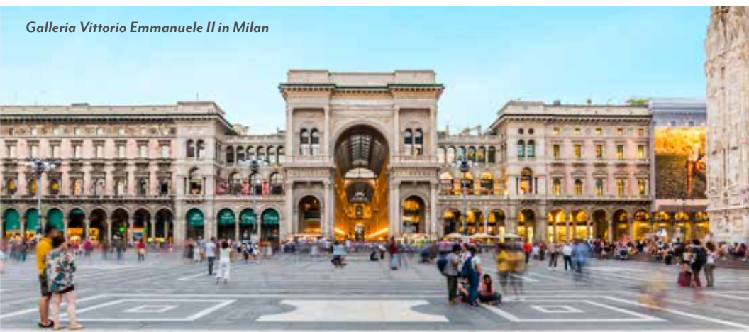
Galleria Vittorio Emmanuele II in Milan

Following breakfast, transfer to Milan Airport for your return flight home. (B)