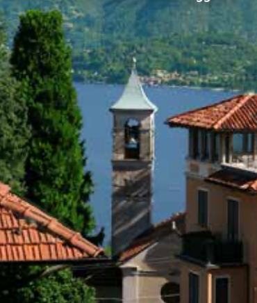
View from Stresa on Lake Maggiore