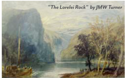
"The Lorelei Rock" by JMW Turner

English poet Lord Byron made the Rhine area enormously popular in 1818 with his narrative poem, "Childe Harold's Pilgrimage." German poets also penned verses as tribute to the area, including Heinrich Heine's famous "Die Lorelei," set at the river's Lorelei rock. English painter JMW Turner, among others, brought these beautiful river vistas to the canvas. And musical composers were likewise inspired. Franz Liszt famously set Heine's Lorelei poem to music, and Schumann's Symphony No. 3 was nicknamed the "Rhenish" symphony. Brahms' Symphony No. 3 leads with a Rhine theme, carrying on the tradition of Lorelei, the elusive siren of the river.