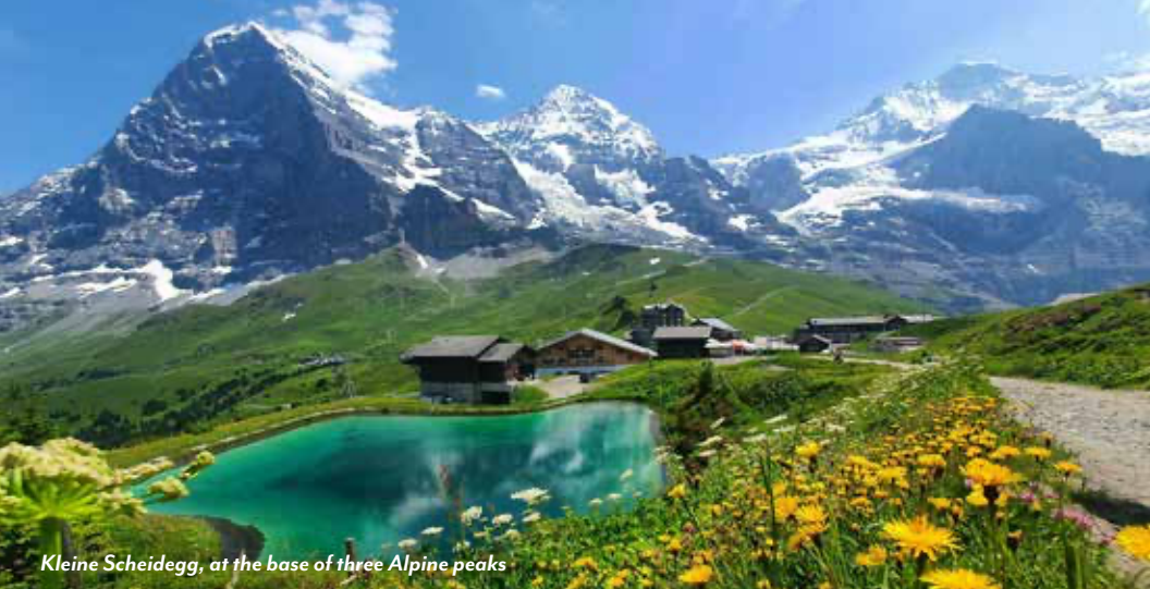
Kleine Scheidegg, at the base of three Alpine peaks

fishermen once lived during the Middle Ages. Visit Notre Dame Cathedral, an exquisitely ornamented Gothic beauty. Join the Captain's Welcome Reception and Dinner. (B,L,R,D)