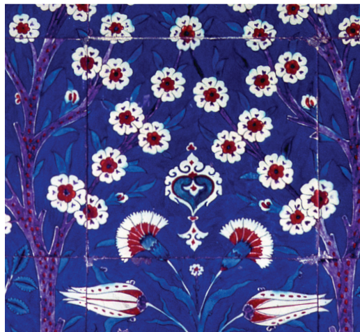
Exquisite Iznik tiles

Day 13: Antalya We discover Antalya’s charming old city (Kaleici) on a morning walking tour through its narrow streets, past historic buildings, mosques, and parks. After lunch at a local restaurant, we visit Antalya’s acclaimed Archaeological Museum, housing priceless artifacts unearthed from sites. B,L