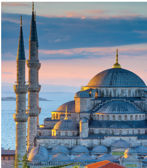
Istanbul’s majestic Blue Mosque

Day 14: Antalya/Perge This morning we explore the ruins at Perge, an ancient Greek city once among the world’s prettiest and most prosperous. We also visit the Duden Waterfalls, which tumble about 130 feet into the Mediterranean. Returning to our hotel, this afternoon is at leisure. Tonight, we celebrate our Turkish adventure over a farewell dinner together. B,D