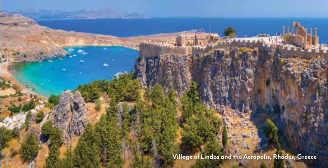
Village of Lindos and the Acropolis, Rhodes, Greece

Visit the Palace of the Grand Masters, a formidable Gothic castle that houses a treasure trove of art, furniture and icons from that era.