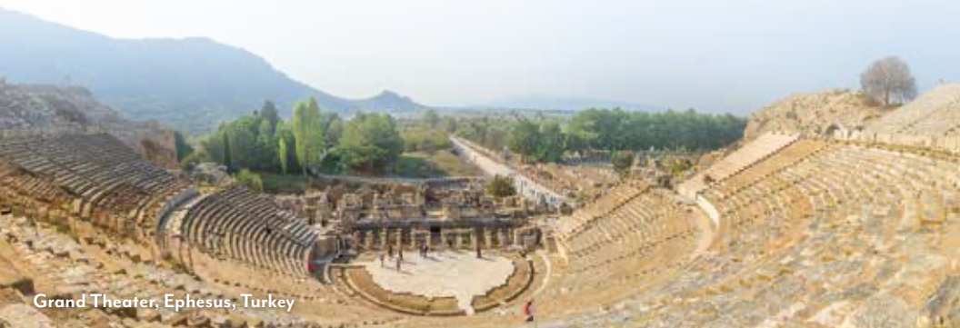
Grand Theater, Ephesus, Turkey

The Roman writer Cicero observed of Athens that “wherever you set your foot, you encounter some memory of the past.” In Greece and Turkey, the stories of antiquity come to life. St. John the Apostle is believed to have penned the Book of Revelation on Patmos; the legend of the lost utopian city of Atlantis lives on in Santorini; and it is on these mythological islands that Odysseus sought redemption in the Underworld and where Orpheus retrieved his first love. Walk the Sacred Way of Delos and discover ancient Akrotiri — the “Minoan Pompeii.” Enjoy exclusive cultural enrichments, including a classical concert at the historical Caravanserai building in Kusadasi and a traditional Greek folklore performance on this immersive itinerary.