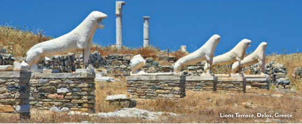
Lions Terrace, Delos, Greece

The Roman writer Cicero observed of Athens that “wherever you set your foot, you encounter some memory of the past.” In Greece and Turkey, the stories of antiquity come to life. St. John the Apostle is believed to have penned the Book of Revelation on Patmos; the legend of the lost utopian city of Atlantis lives on in Santorini; and it is on these mythological islands that Odysseus sought redemption in the Underworld and where Orpheus retrieved his first love. Walk the Sacred Way of Delos and discover ancient Akrotiri — the “Minoan Pompeii.” Enjoy exclusive cultural enrichments, including a classical concert at the historical Caravanserai building in Kusadasi and a traditional Greek folklore performance on this immersive itinerary.