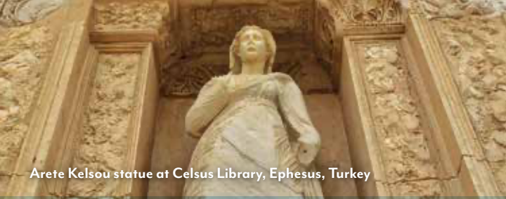
Arete Kelsou statue at Celsus Library, Ephesus, Turkey