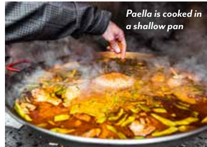
Paella is cooked in a shallow pan

Morocco and the coasts of Portugal and Spain have a rich culinary history that has changed the face of global cuisine, most remarkably with dishes featuring bold flavors and spices. One of the most famous foods hailing primarily from Valencia, Spain, is paella — a flavorful rice dish traditionally made with olive oil, chicken broth, vegetables and a variety of meats and seafood. The dish got its name from the traditional wide, shallow pan used to cook it, with paella literally meaning “frying pan” in Valencian Spanish. The signature yellow color of the dish traditionally comes from saffron, but turmeric and calendula can be used as substitutes. Paella had humble beginnings, originally being considered a lunchtime meal for farmers and made with whatever was on hand at that time. Another popular dish native to the region is couscous , which has roots in Morocco and is prepared from ground wheat rolled into pellets. Experience these savory cultural staples firsthand on our tour with a cooking demonstration and lunch in Tangier, Morocco, and an optional trip to the market in Valencia, followed by a paella cooking class with a local chef.