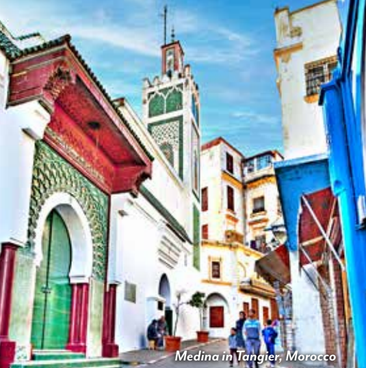
Medina in Tangier, Morocco