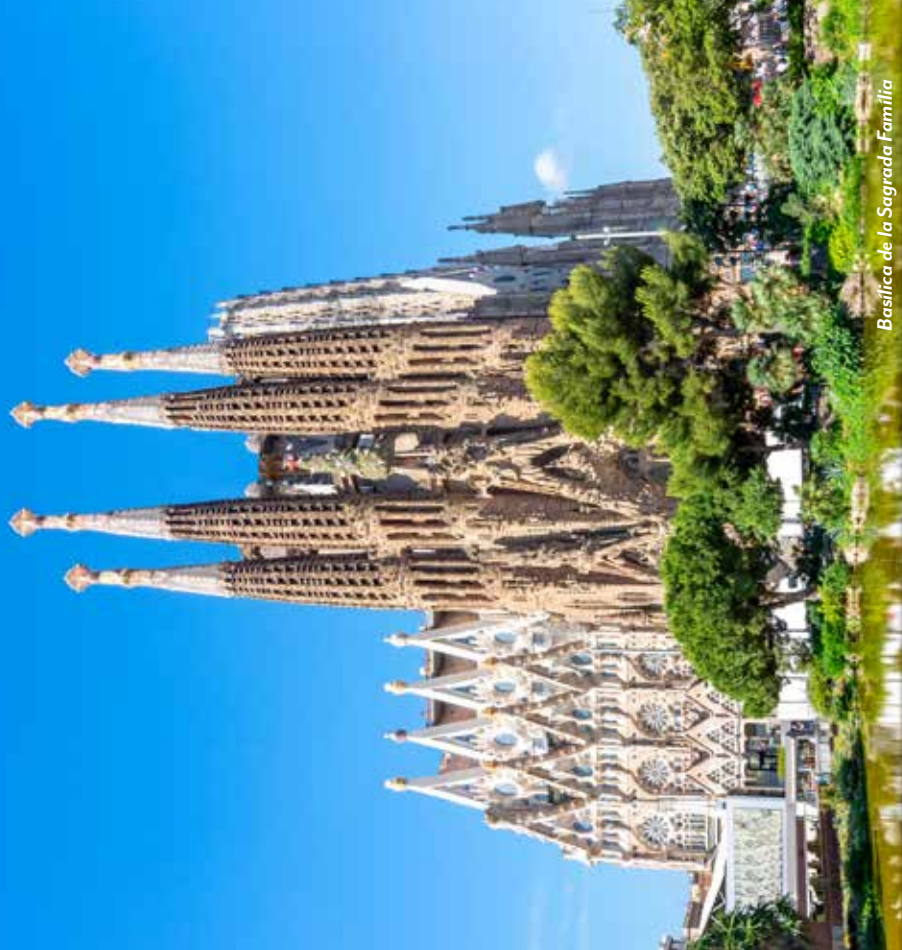
Basilica de la Sagrada Família

Early Booking Savings* available | Save $2,000 per couple!