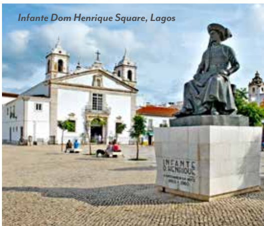
Infante Dom Henrique Square, Lagos

After breakfast, disembark the ship and transfer to the Barcelona Post-Tour or travel to the airport in Barcelona for your return flight home. (B)