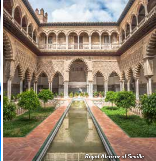
Royal Alcázar of Seville

the Alhambra Palace and its magnificent Generalife gardens —collectively a UNESCO World Heritage site. Originally designed as a military area, the Alhambra became the residence of the royal court of Granada in the middle of the 13th century, and later a citadel with high ramparts and defensive towers. Admire the exquisite detail that made it both an artistic treasure and a hilltop stronghold. (B,L,D)