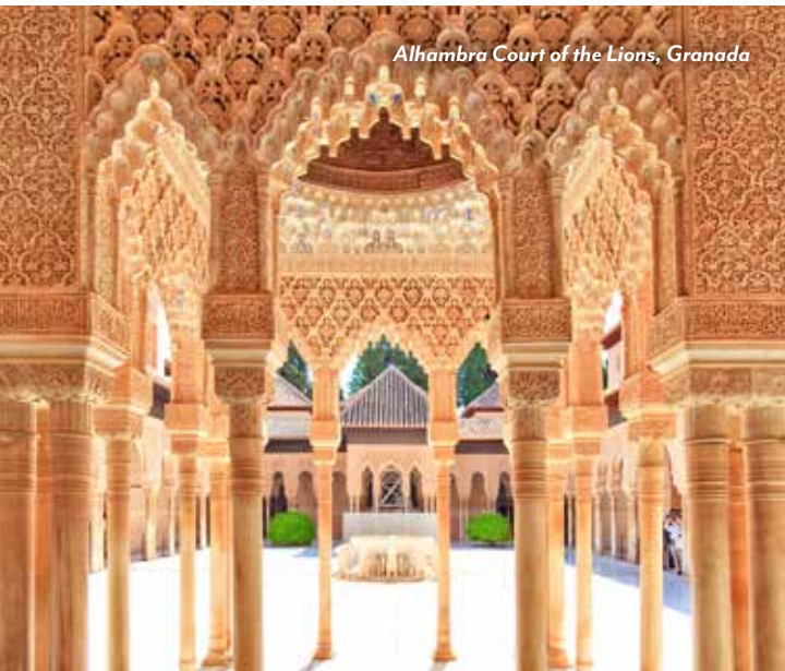
Alhambra Court of the Lions, Granada

Discover the architectural treasures and interconnected history of Portugal, Morocco and Spain, revealed through their fortified medieval towns and coastal cities. The cross-continental collaboration and joint influences of Greco-Roman, Judeo-Christian and Moorish civilizations ushered in a new era of advances in mathematics, science, medicine, horticulture and philosophy — creating the catalyst for global trade from the 15th through 18th centuries. Ships sailing from these shores to the New World brought back riches to the region, generating great wealth among this unique mélange of cultures and sparking a veritable renaissance in art and architecture. From the coasts of Portugal and Spain to the ancient maritime port of Tangier, Morocco, experience the allure of these seaside gems as you retrace voyages in the wake of mariners past.