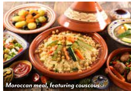
Moroccan meal, featuring couscous