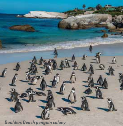
Boulders Beach penguin colony