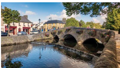
Above: Kylemore Abbey | Below: Westport